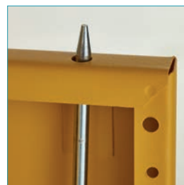
Three points locking for secure storage.