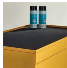
Dished top available on half height cupboard.